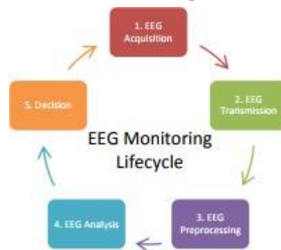
Figure 2: EEG Analysis Lifecycle

Mistake! Reference source not found. Shows the EEG analysis lifecycle where the above phases are successively listed.